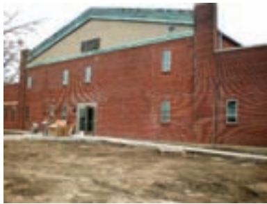
Building 17 at WPAFB is the new home for the 77th AESG.

The 77 th AESG is the unit charged with providing advanced performance, survival, and force protection capabilities to U.S. and allied military forces. This is done through development, production, and sustainment of human-centered systems which include life support; nuclear, biological and chemical defense; aeromedical services; AF uniforms; mishap analysis; force health and