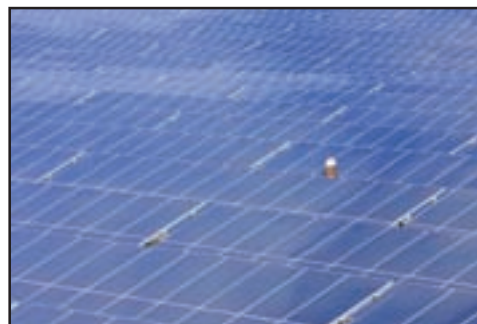
DP&L Yankee Solar Power installation by ESI.

Although the cost to build a solar array is one and a