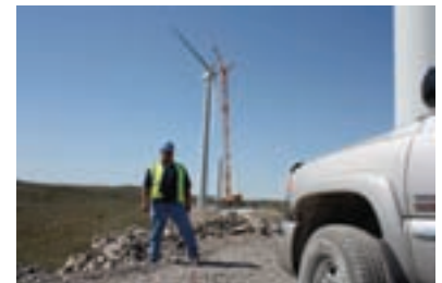
CRT on the job at Blue Canyon Wind Farm.

The farm, which consists of 66 General Electric 1.5MW turbines, achieved commercial operation in October 2009. As a subcontractor to Midwest Electric out of Columbus, CRT was responsible for splicing the fiber to connect all the turbines together in an underground interduct. They installed 12 strand fiber to the first tower then daisy chained around to link all the towers to the main distribution sub-station, where the electricity would be sent out for public sale and consumption. The