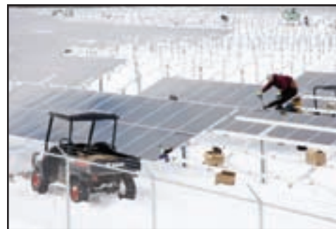
The snow in February created a challenge to this ESI solar installation.

Producing power where it is used lessens the strain on the electric grid and minimizes the need for more transmission lines.