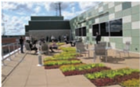
Artist's rendering of the CTA.

Commercialization of Advanced Sensor Technology (IDCAST), led by the University of Dayton. It's the anchor tenant of Tech Town, Dayton region's technology-oriented district. IDCAST is a center of excellence in chemical and biological sensing technology established by a $28 million State of Ohio Third Frontier