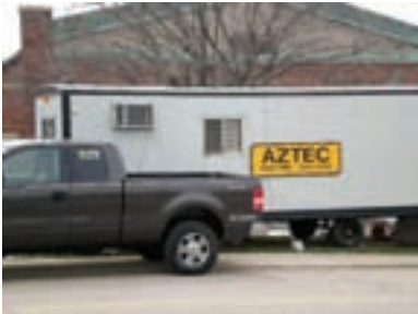
Aztec Electric at the jobsite for the Building 17 renovation.

Bringing a vacant historical building back to life is a challenge. Especially when the updates include the installation of state-of-the-art lab equipment, complete with a vibration room. That is exactly what happened in the