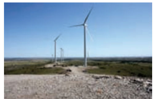
Blue Canyon Wind Farm near Lawton, Oklahoma

"The farm itself is something to see," says C.J. "First roads had to be built to access the area. Most of the wind turbines were constructed in areas where rock had to be blasted and