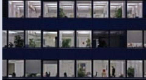
Motion sensor lighting.

your building. Depending upon the level of building energy audit, the auditor will then quantify how much