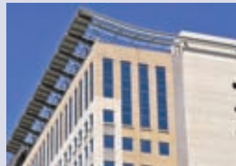
U.S. Army Corps of Engineers goes for LEED Gold at their new complex in Fort Belvoir, VA. The new complex will use 30% less electricity than conventional buildings.

audits often also look at water consumption (even though that is not technically considered energy). An energy auditor comes out to your building and interviews facility managers, inspects lighting, air conditioning, heating and ventilation equipment, controls, air compressors, water consuming equipment, and anything else that is using