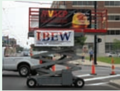
Sponsors included the MVACP, NECA and the IBEW.

A special thanks to Chapel Electric, ESI Electrical Contractors and Studebaker Electric for donating their equipment and man power for the event.