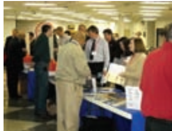
Counselors learn about the apprenticeship programs.

one course a semester at Owens during their apprenticeship program, once they graduate to a Journeyman, they will also