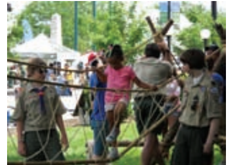
Scouts assist at the Monkey Bridge.

Exhibitors included the Ohio National Guard who brought in a HUMVEE, Pro Polaris with ATV equipment and the Electrical Trades of Central Ohio demonstrated their Green Power Alternative Demonstrator (GPAD). The GPAD is a portable electrical