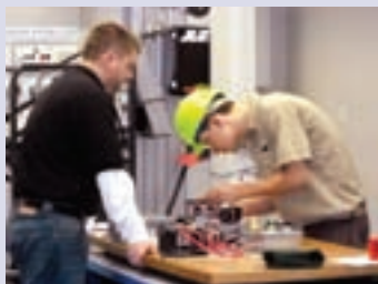
Motor Controls competition.

provide quality education experiences for students in