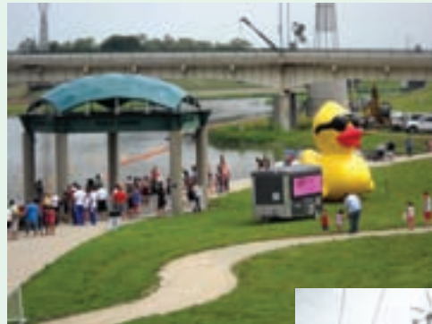
The URS Rubber Duck Regatta (above).