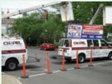
Chapel Electric contributed two bucket trucks for the cookout.