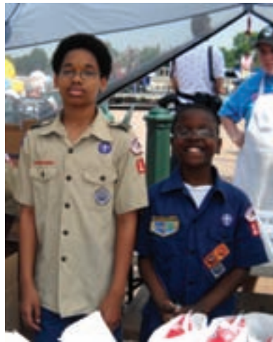
Boy Scouts serving up lunch.

Electrical Contractor's Association (NECA) and the International Brotherhood of