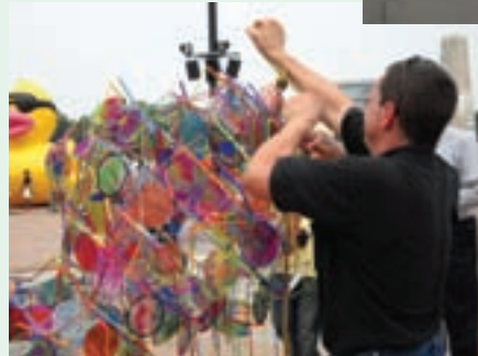
ESI Electrical Contractors brought their bucket truck to hang the URS Art Mobile.