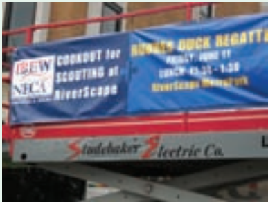
Thanks to Studebaker Electric.