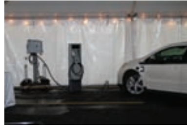
The Electric Vehicle tent.

Bowling Green State University and Youngstown University were challenged to present Energy Audits on a