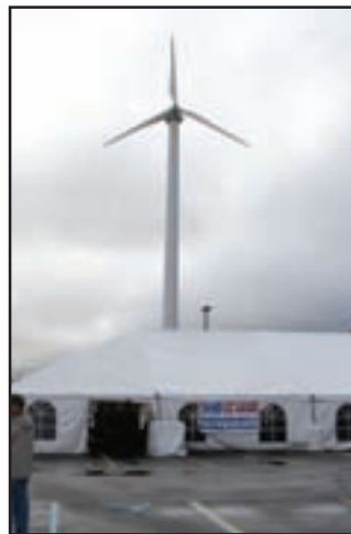
Wind turbine ribbon cutting ceremony at Toledo Electrical Training Center.

the lights on when natural resources may be reaching their limits. NECA and the IBEW are positioned to lead the way in bringing such alternative energy to our customers. This job remains